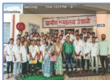
↑ Hospital Visit ↑