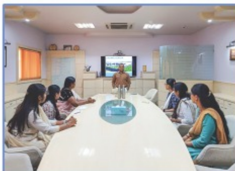
↑ Faculty Visit to Medispray Laboratories Pvt. Ltd. Satara ↑