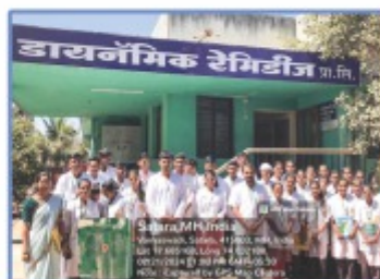
↑ Student Visit to Dynamic Remedies Pvt. Ltd. ↑