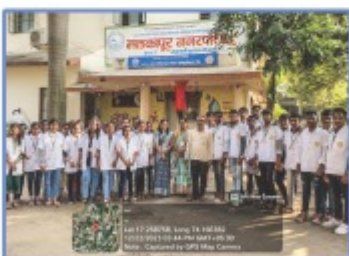
↑ Water Purification Plant Visit ↑