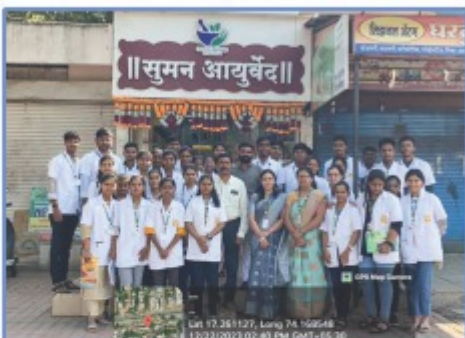
↑ Ayurvedic Pharmacy ↑

Perhaps, it was great experience and surely student learnt comprehensive information from it undoubtedly.